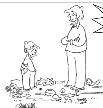
"Gravity. One of God's wonders."

Tweens & Teens Class coming in Spring, 2012